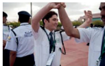
Practical training of guards

These courses, delivered in both English and Arabic, are accredited via City and Guilds from the UK to ensure the highest international standards are adhered to.