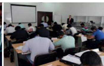
Security Managers courses